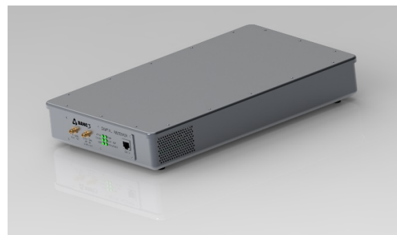
Model No. TSD-1000 covers 1.0 – 4.4 GHz instantaneously